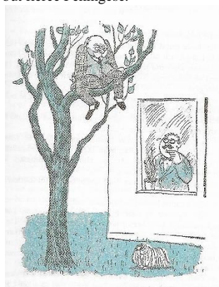
Illustration by Poul Ströyer

(Birth of a Salesman, 1950) On a visit to New York Lord Emsworth is chased up at tree by a small but fierce Pekingese.