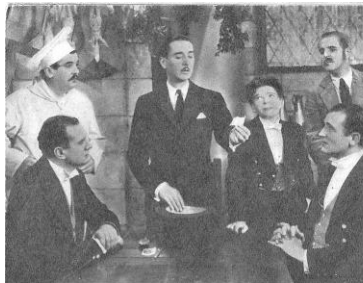
»Vi har samlats för att dra lott om vem som skall bli lady Alyces tillkommande, sade mr Keggs högtidligt.