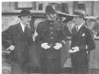
Reggie blev uttackerad av en obekant herr.